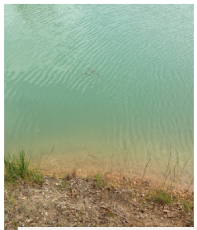
Figure 9. Water clarity from the pond in Figures 7 and 8, approximately 8 hours after treatment with alum. Schools of sunfish are easily visible in the newly cleared water.