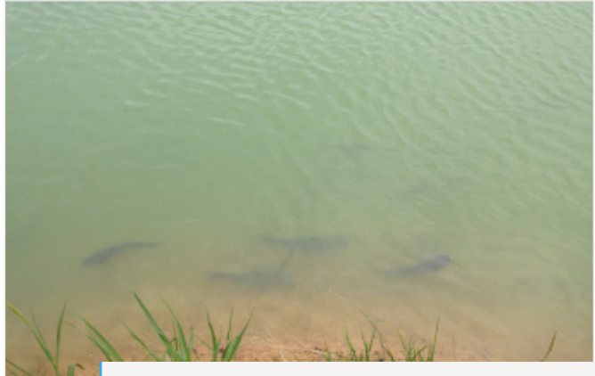
Figure 8. Water clarity from the pond in Figure 7, approximately 3 hours after treatment with alum. The water has already cleared enough to see catfish swimming in shallow water along the bank.

or buckets were not available, at this point, a clear glass can be used to gently remove a sample of water from the top of the bucket to assess clarity. It is common to see between ¼ and 2 inches of loose sediment at the bottom of the bucket or jar. This is the clay and organic particles that have been flocculated by the clearing treatment. Be careful not to disturb this layer when examining the samples, or the sediment may accidentally become suspended in the water sample again. If this happens, allow the samples to sit undisturbed for another 12 hours and reevaluate.