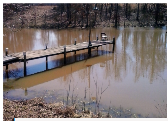
Figure 2. This photo displays turbid water, which can cause the fish within the pond to have an undesired flavor.

Todd Sink<sup>1</sup>, Paityn Warwick<sup>2</sup>, and Elizabeth Silvy<sup>3</sup>