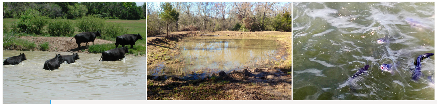
Figure 3. Livestock wading in ponds; lack of vegetation around a pond, resulting in runoff; and large quantities of bottom-dwelling fish, such as catfish, can stir or contribute clay particles to ponds, causing the water to become turbid.

Turbidity can result from high winds, abrupt changes in air temperature, and excessive rainfall disturbing clay particles, causing them to become suspended in the water. Wildlife, such as ducks, beavers, muskrats, and wading birds; livestock wading in or drinking from the pond; invasive species such as common carp, nutria, and feral hogs; and aeration systems can also cause suspension of clay particles. In some cases, fish species intentionally stocked into the pond, such as grass carp or catfish, can stir the bottom sediment, causing turbidity.