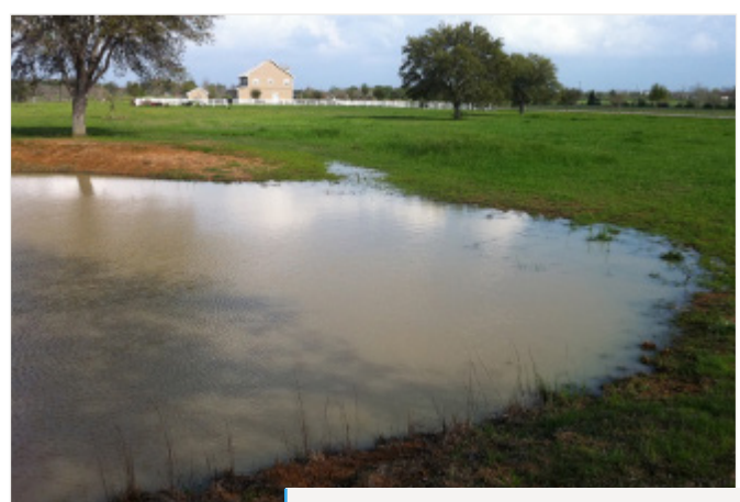
Figure 7. Water clarity of pond prior to treatment with aluminum sulfate.

After 12 hours undisturbed, observe the changes in the water clarity within the test buckets. To determine which dosage to use, look at the clarity of the water and use the minimum dose required to make the water clear. For example, if buckets one and two are still completely or partially cloudy, but buckets three and four are both clear, the dose in bucket three would be used. If the tests were conducted in colored buckets because clear jars