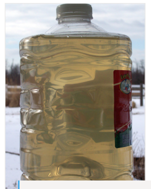
Figure 4. Clear jug containing pond water used to test turbidity. While some sedimentation can be seen at the bottom of the jug, the photo still displays cloudy water, indicating that the chemistry of the water needs to be tested.

To test turbidity or issues with suspended particles, begin by taking a water sample in a clear jar. Place the water sample on a countertop and do not touch or move the jar for 24 hours. If the sediment settles to the bottom and the water now appears to be clear, this indicates that the pond has a problem caused by a physical issue identified above, such as fish, wildlife, an aerator, or rainfall/runoff stirring particles in the water. If this is the case, identify and remove the physical issue to clear the water. If the