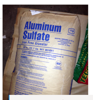
Figure 5. Aluminum sulfate, one of the "big guns" of clearing turbidity, is displayed in the image above. Due to its ability to rapidly lower the pH of pond water, it should only be used on ponds with an alkalinity higher than 50 ppm.

Aluminum sulfate. commonly referred to as alum, is one of the most effective and oldest treatments for flocculating clay particles in a pond. It is also referred to as one of the "big guns" in clearing muddy water because it works in many different water chemistries and works where other treatments such as gypsum and agricultural lime do not. A drawback of alum is that it can rapidly lower both the pH and alkalinity of the