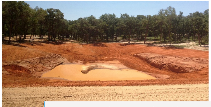
Figure 1. Newly constructed pond illustrating construction in clay soils. Photo displays how clay particles easily become suspended as the pond begins to fill, creating turbid or muddy water.

It is important to understand the problems that turbidity produced by suspended clay particles could potentially cause in a pond's ecosystem. Clay turbidity in ponds reduces the ability of light to penetrate the water to depth, which results in reduced amounts of phytoplankton, and subsequently, reduced natural oxygen production and food for fish. Not only could muddy or turbid water cause stunted growth in fish, but overall aesthetics of the pond can be reduced. Another concern of muddy ponds is that suspended solids can lead to undesirable flavors, often referred to as "off-flavors," in fish harvested from the pond. Muddiness of ponds can also promote the growth