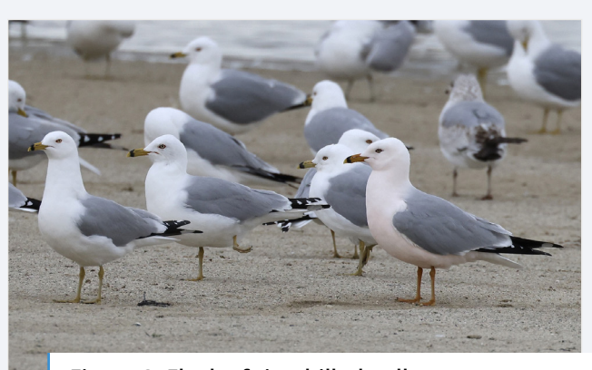
Figure 3. Flock of ring-billed gulls.

The term "gulls" refers to a group of birds found in the Laridae family. While this family of birds encompasses 99 unique bird species, 22 gulls are commonly found in Texas, and only eight species of gull are typically associated with human-wildlife conflict (Winkler et al., 2020a; Lowney et al., 2018). The following species are the most common when it comes to gull-related damage: herring gull, laughing gull, ring-billed gull, great black-backed gull, California gull, Franklin's gull, Bonaparte's gull, and glaucouswinged gull (Lowney et al., 2018). Gulls are often associated with oceans and seashores, but as a migratory