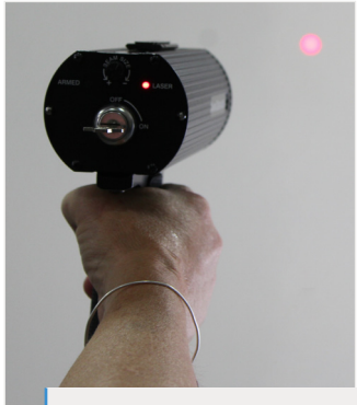
Figure 10. An example of a hand-held laser.

are typically roosting (Fig. 10; Seamans & Gosser, 2016). The use of lasers has proven most effective in the low light of dawn and dusk because some species are less likely to be dispersed by a laser during full darkness (Dorr et al., 2018; Avery & Lowney, 2016). It is important to follow all safety recommendations