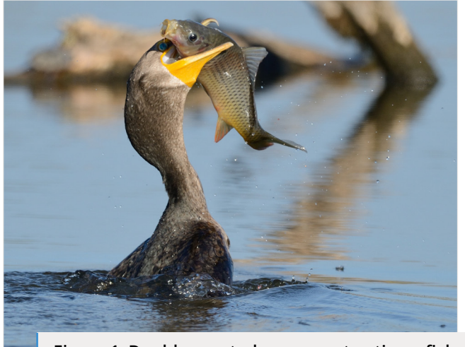
Figure 1. Double-crested cormorant eating a fish.

Across the state of Texas, birds rely on a variety of aquatic habitats to meet needs ranging from foraging habitat and water access to shelter from their own predators and everything in between. Conflicts can develop when birds concentrate on aquatic habitats economically or recreationally important to humans. Many times, these issues are related to artificial bodies of water (lakes, tanks, ponds, etc.) that have been stocked with fish for recreational purposes. In these situations, a bird—or flock of birds—can negatively impact a valuable resource while exhibiting very normal wildlife behavior. Other issues can arise when birds are drawn to an aquatic resource and then use surrounding structures to perch. The buildup of droppings or nesting material can become unsightly and even lead to health concerns when near recreational structures (docks, pavilions, etc.). When managing these issues, it is important to remember that the bird in question is a native animal that plays an important role in the environment.