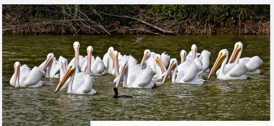
Figure 4. A flock of foraging pelicans.

Two species of pelican can be found in Texas: the brown pelican, which is only in coastal habitats, and the American white pelican, which can be found throughout much of central and western North America (Knopf & Evans, 2020). The diet of American white pelicans consists primarily of schooling fish that are smaller than half of the pelican's bill length (Knopf & Evans, 2020). White pelicans are opportunistic feeders and will also consume crayfish, larger fish, salamanders, and tadpoles when available (Knopf & Evans, 2020). American white pelicans prefer to feed in shallow water and may forage for their food individually, in small groups, or in large, coordinated groups of over 25 individuals (Knopf & Evans, 2020; King, 2019). When pelicans concentrate their foraging efforts on fish that are in captive environments, such as an aquaculture facility or a stocked pond, it can cause damage to fish populations (King, 2019). The severity of losses from consumption depends on the number of pelicans present, the size of the fish consumed, and how long the pelicans remain at one location. Another concern related to American white pelicans feeding in stocked fishponds or aquaculture facilities is that they are the primary host for the parasite