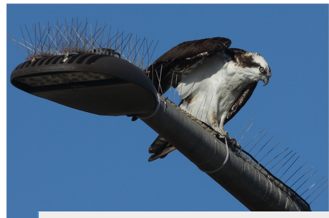
Figure 7. Bird spike perch deterrents should be resistant to bending so that larger birds cannot manipulate them into a perch.

There are also prefabricated systems that allow a manager to run an electrified tape or track on a narrow perching surface that will briefly and safely shock any bird attempting to perch (Wildlife Services Florida, 2017). This option is only recommended in areas where potential perches are inaccessible to people who could accidentally come in contact with the device.