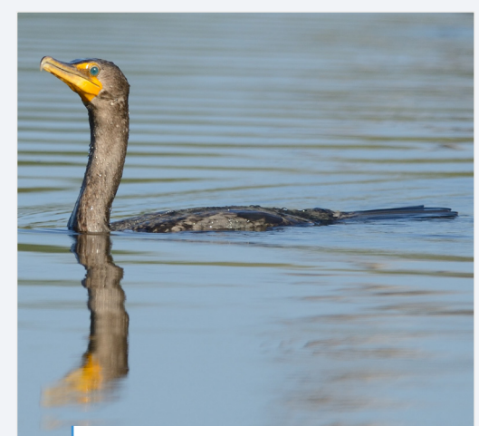
Figure 2. Double-crested cormorant swimming.

In many cases, diet studies have found that cormorants do not typically consume large quantities of commercial or sport fish species and instead focus their diet on small fish and shrimp (Dorr et al., 2021; Dorr et al., 2016). However, as a colonial bird, cormorants sometimes feed in groups large enough to negatively impact natural fisheries in lakes, stocked ponds, and aquaculture facilities (Dorr & Fielder, 2017). Many of the issues seen with cormorants involve areas where fish are artificially concentrated, providing easier hunting for these birds, such as stocking release sites, spawning sites, fish farms, and stocked fishponds (Dorr et al., 2016). In natural settings such as lakes and ponds, issues can also occur when cormorants concentrate on a specific fish size, which can reduce populations and recruitment long term, or when they feed primarily on smaller fish that are important food sources for popular sport fish (Dorr & Fielder, 2017).