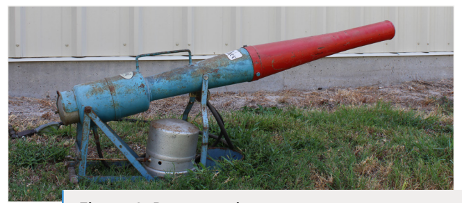
Figure 9. Propane air cannon.

Propane or air-powered cannons (Fig. 9) can be effective avian harassment devices. Rather than firing a projectile, they use a compressed charge of ignited propane or air to make a loud noise when ignited (propane) or released (air). Bear in mind that municipal sound ordinances must be considered when planning their use. There are a variety of avian deterrent cannons available for purchase, but managers should ensure that whatever system they use does not operate on a regular interval that the birds can learn and predict. Successful use of sound deterrents relies on startling the birds, and therefore, managers should incorporate changes in timing, cannon position, and cannon direction as appropriate for their application (Seamans & Gosser, 2016).