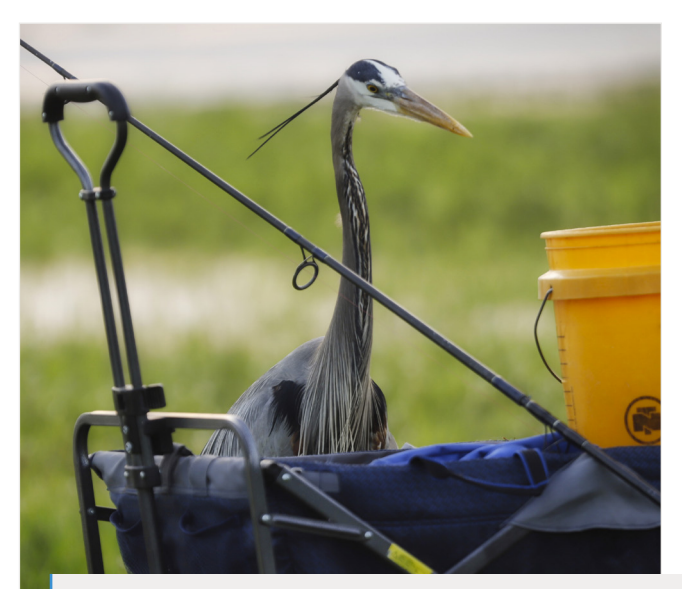
Figure 11. Great blue heron checking a fishing cart for any potential food.

If additional information is required, a qualified professional can provide situation-specific recommendations for management efforts. Contact the Texas Wildlife Services or the Texas A&M AgriLife Extension Service for more information.