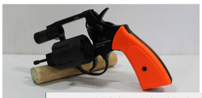
Figure 8. Unloaded pyrotechnic launcher.

Firearms may also be required (Lowney et al., 2018). Regardless of permit requirements, proper authorities should always be notified in advance to avoid any misunderstandings related to the sound or appearance of the pyrotechnics. When using pyrotechnics, managers should ensure the harassment effort is not used on a regular interval that birds can learn and predict. Successful use of sound deterrents relies on startling the birds, and therefore, randomized timing and deployment locations should be used.