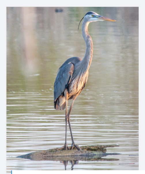
Figure 5. Great blue heron scanning the water for prey.

Like gulls, the terms "heron" and "egret" actually encompass a number of species. When grouped together, herons and egrets are described as long-legged, long-necked birds often associated with aquatic habitats and curving their necks while in flight (Hoy, 2017). In aquatic environments, these birds can forage in a solitary manner or as a group. As wading birds, their foraging is typically limited to shallow water, where they can walk to search for food. Their diet varies from one species to the next but is largely made up of fish, with crustaceans, insects, amphibians, and even small birds and mammals when available (Winkler et al., 2020b). Conflicts with these birds typically involve small captive populations of fish or areas with sport fish that are frequented by large numbers of herons and egrets (Hoy, 2017).