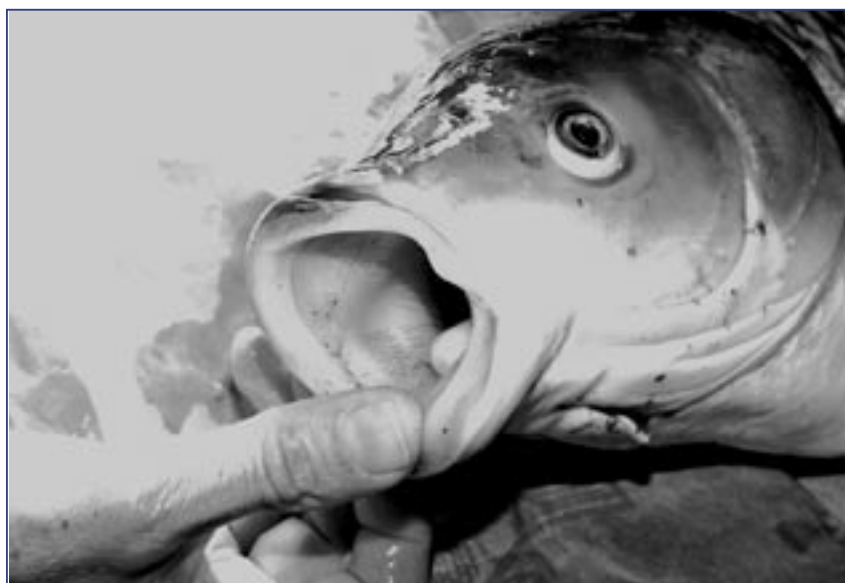
Figure 2. The mouth of a grass carp. Notice the lack of teeth.

Because the grass carp is a fish native to large rivers, it is attracted to flowing water. During periods of high flow, grass carp will leave a pond through the emergency spillway. This problem can be reduced