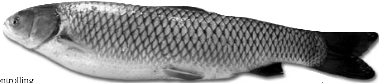
Figure 1. Grass carp or white amur ( Ctenopharyngodon idella )

Controlling vegetation in ponds is critical to good management. Too much vegetation interferes with fishing, swimming, and boating. Nutrients that could be stimulating algae, which effectively support fish production, are used by weedy plants. Thick beds of weeds can cause oxygen depletion, leading to fish kills. Weeds also interfere with feeding by largemouth bass, reducing their growth rate. In large reservoirs, about 20 percent weed coverage has a positive effect on fish reproduction and growth. Because ponds are shallow, the presence of a few weeds can quickly turn into an overgrowth of plants.