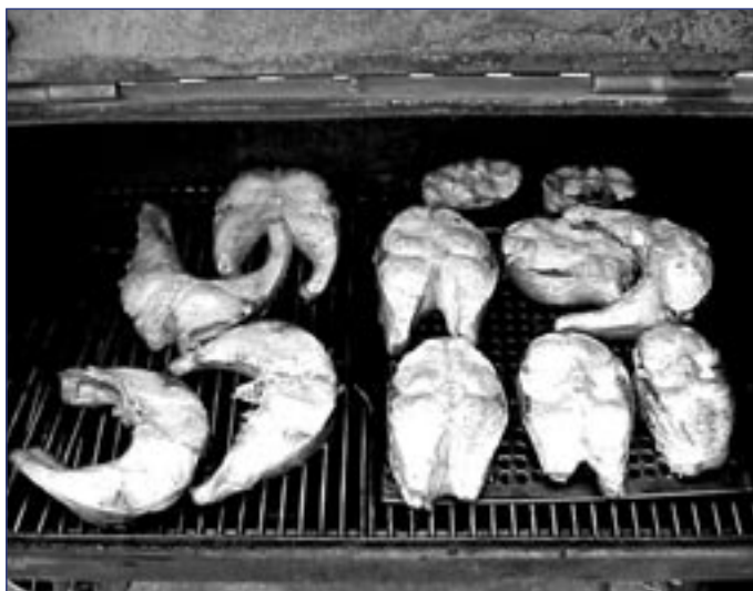
Figure 4. Grass carp steaks are suitable for grilling.

Table 3 provides recommended grass carp stocking sizes and rates for use in ponds. Stock larger grass carp (8 to 10 inches) in ponds with established bass