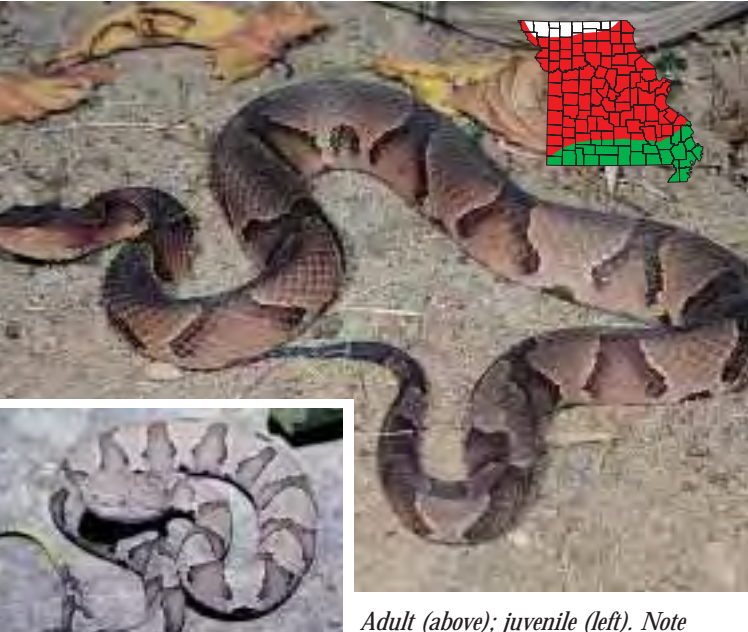
Adult (above); juvenile (left). Note the yellow-green tail on the juvenile.

All of Missouri's venomous snakes are pit vipers, which means they have an opening on each side of the head, called a sensory pit. A pair of hollow fangs are located on the front of the upper jaw. In daylight these snakes have eyes with vertical pupils—like a cat—while all harmless snakes have round pupils. This characteristic is not reliable for identification at night. Even the underside of the tail is helpful in distinguishing the two types of snakes: our venomous species have a single row of scales, while harmless snakes have two rows of scales.