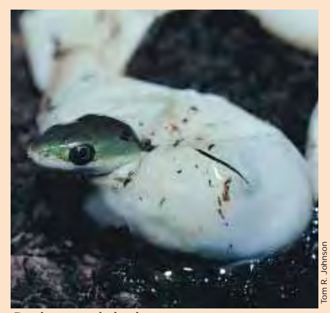
Rough green snake hatching.

reproduction is slightly advanced over egglayers. The young snakes are retained and protected inside the female during their development. Each young snake is protected inside a thin, saclike membrane containing yolk for nourishment. Some of the young snakes break through the membrane while inside the female and emerge from the female in a tight coil; others break through after being born. Snakes that develop inside the female are normally born in mid to late summer.