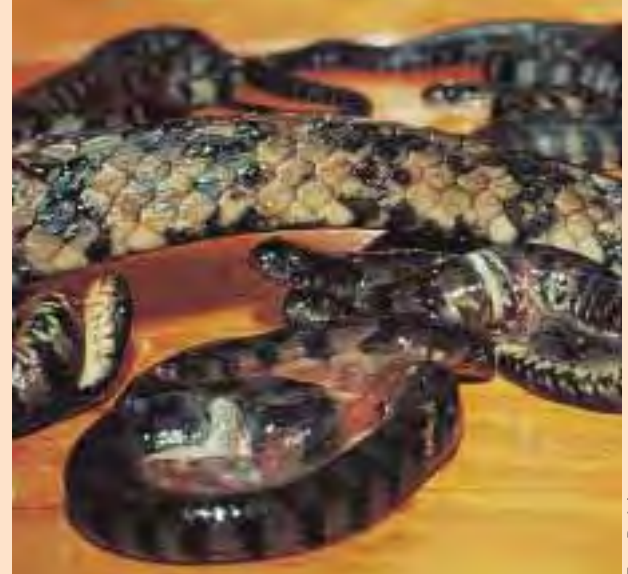
Diamondback water snakes being born.