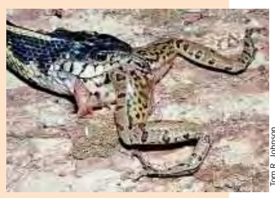
Eastern garter snake eating a leopard frog.

Red milk snake Lampropeltis triangulum syspila