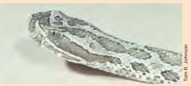
Eastern Massasauga Rattlesnake Missouri's venomous snakes have vertical "slit" pupils.