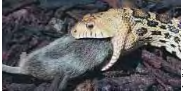
Bullsnake eating a mouse.

Equal opportunity to participate in and benefit from programs of the Missouri Department of Conservation is available to all individuals without regard to their race, color, national origin, sex, age or disability. Complaints of discrimination should be sent to the Department of Conservation, P.O. Box 180, Jefferson City, MO 65102, OR U.S. Fish and Wildlife Service, 18th and "C" Streets NW, Washington D.C. 20240, Missouri Relay Center-1-800-735-2966 (TDD).