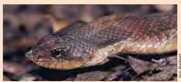
Eastern Hog-nosed Snake (non-venomous) Missouri's non-venomous snakes have rounded pupils.