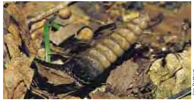
The rattle is a familiar characteristic of rattlesnakes. Other venomous and non-venomous snakes may shake their tails in dry leaves.