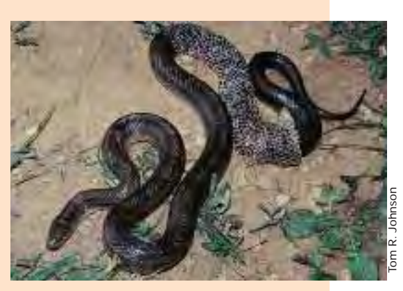
Prairie kingsnake shedding skin.

nakes have generated more fear and misunderstanding than any other group of animals. Psychologists have proved that a fear of snakes is acquired; we are not born with it. Once people learn some of the interesting facts about snakes and discover that most of them are harmless and beneficial, their aversion may diminish. With patience and understanding, almost anyone can overcome a dread of snakes and actually enjoy studying them. One thing is certain—even people with a well-developed fear of snakes are curious about them.