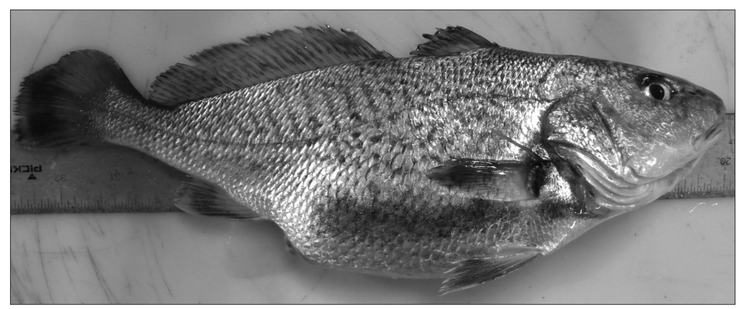
Figure 1. A gravid female Atlantic croaker with free-flowing eggs 72 hours after injection with a salmon Gonadotropin-Releasing Hormone analogue implant.

Wild-caught Atlantic croakers were first induced to spawn with hormones (chorionic gonadotropins) in the 1970s. Injections had to be repeated many times for each female over a period of days or even weeks, and only 25 percent of females produced viable eggs using chorionic gonadotropins. Therefore, induced spawning, and the reproduction of croakers in general, were neglected until recently when other hormone treatments became available. The use of hormone implants containing salmon Gonadotropin-Releasing Hormone analogue (sGnRH<sub>a</sub>) has been successful (Fig. 1). A single 75-µg sGnRH<sub>a</sub> implant injected under the skin when water tempera-