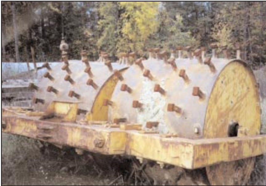
Figure 1. Sheep's foot roller.

the soil on the feet extending from the drum. Adequate compaction will require at least four to six passes of the roller over all of the pond bottom and sides. Tractor-drawn wheeled dirt pans also can be used over the dam or levee, although they do not compact as well as a roller.