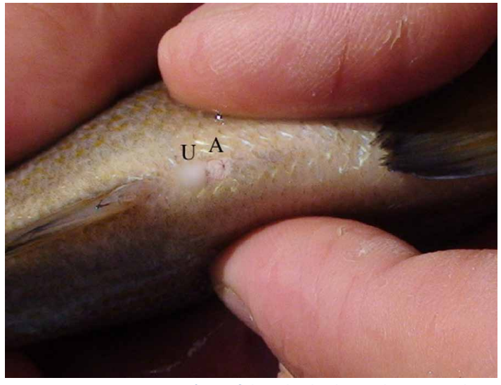
Figure 2. Strip-spawning of a pigfish male, displays milt expressed from the urogenital opening (U) posterior to the anus (A).

fish such as menhaden being a supplement for months prior to spawning. An examination of the nutritional content of wild pigfish larvae could divulge the proper nutrients needed for a broodstock diet and subsequent optimal larval development. Pigfish broodstock at IRREC were fed a combination of a 2.0 mm slow-sinking, pelleted commercial diet (containing 50% crude protein and 15% crude lipid) and frozen squid.