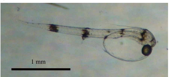
Figure 3. Pigfish larvae, day zero post hatch.

cells/mL (~28 cm secchi depth) during larval feeding. Daily samples of the larval tank will ensure that proper algal and live feed densities are maintained as the pigfish larvae grow. Once feeding begins, water exchange becomes necessary with the implementation of a recirculating or flow-through system.