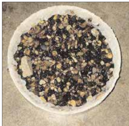
Figure 4. Removable artificial substrates can be used during induced spawning of sunfish.

ature and photoperiod to induce spawning. Fish are held in tanks at a male-to-female ratio of 1:2 to 1:4. Removable artificial substrates are placed in the tanks for spawning (Fig. 4). The artificial nest pictured was made by removing the bottom 2 inches (5 cm) from a 5-gallon (19-L) plastic bucket and adding loose pea gravel to the bottom.