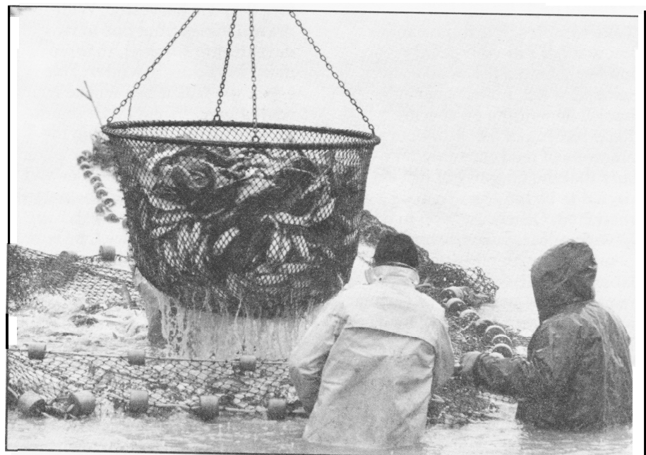
Fish basket on boom truck for moving fish from pond to truck.

Plan easy removal. Before planning the harvest operation, make sure that fish can be removed eas-