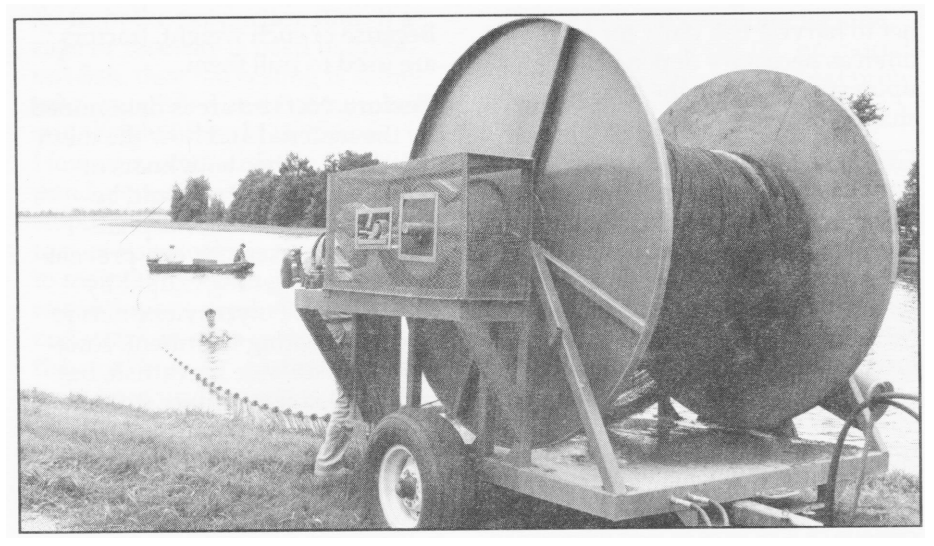
Hydraulic seine reel used in seining large ponds.

reel is mounted on a trailer. Some have hydraulic controls that pivot the reel into various positions to line up with the seine as it is landed.