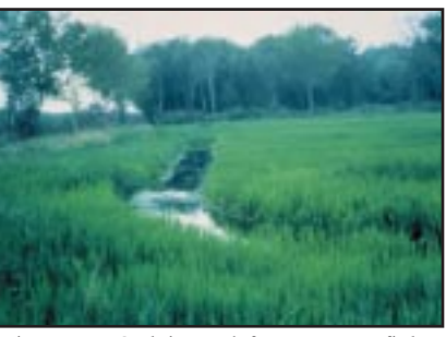
Figure 1. Cultivated forage crawfish pond.

May/June: Drain pond and repeat cycle without restocking crawfish.