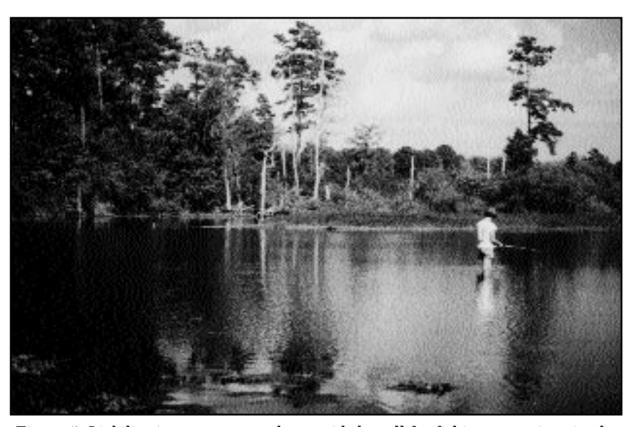
Figure 5. Liability insurance must be provided at all fee-fishing operations in the event that someone is injured.

For additional information on fee fishing and pond management, contact your local county Extension agent, state fisheries specialist, local USDA Soil Conservation Service office or the nearest office of your state Fish and Game Commission. Phone numbers for these agencies are listed in the government section of your phone book.