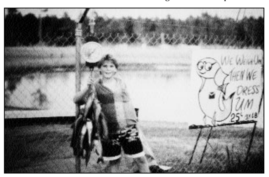
Figure 3. Children like to fish at fish-out ponds because of the high likelihood of catching fish.

Fish-out operations should have a minimum of two ponds, allowing anglers to select where they fish. Having more than one pond