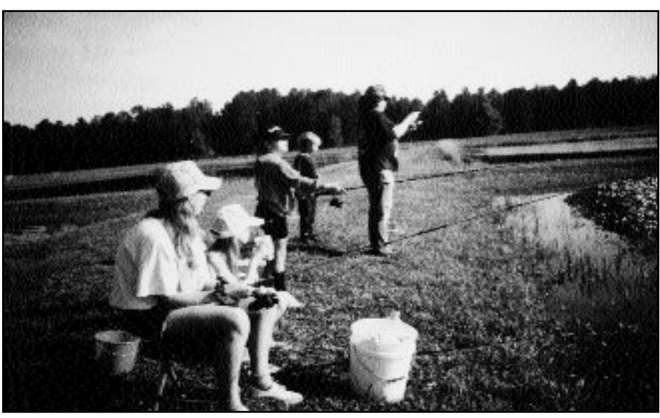
Figure 4. Day lease and fish-out pond operators must be willing to deal with people.

Fee-fishing operations are good markets for fish producers. Production acreage in many states is small and geographically dispersed. Producers can sell their fish live to local fee-fishing operations. Thus, there is no need to build a processing facility, and many state health regulations can be avoided by selling live fish. Producers can often get a higher price per pound from fee-fishing operators than from processors.