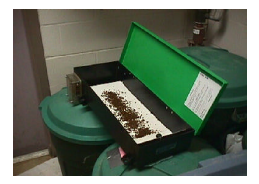
Figure 3. Automatic Belt Feeder.

Both surviving tanks were fed at 5% of their body weight per day. Feed was distributed over a 24-hour cycle using automatic belt feeders (Figure 3). A trout starter diet (crumble size) was used. Mortalities were removed and counted several times per day. Dissolved oxygen (range 6.2-10.4 parts per million) and temperature (range 67.1-81.4 °F) were recorded daily. After 1 week, fungus was noted on several of the fish in both groups. Consequently, formalin (25 parts per million) was added daily to aid in the control of fungus.