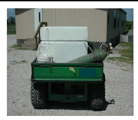
Figure 2. A transportation vehicle

when transporting fish. Poor water conditions can adversely affect the immune system of the fish, increase susceptibility to disease, and may lead to illness or death. Determine these differences before moving the fish, and, if necessary, make adjustments to the water. Then acclimate the fish. Acclimation is the process of slowly introducing the fish to different quality water to allow physiological adjustments to occur gradually over time.