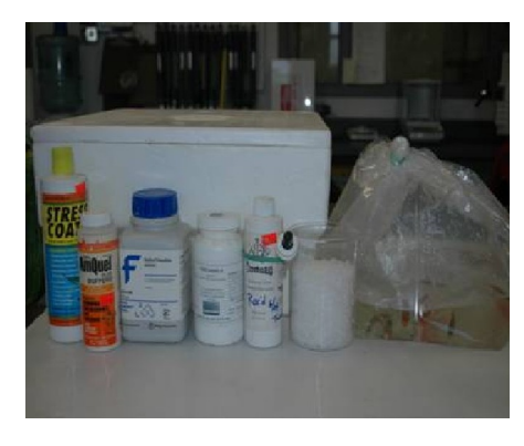
Figure 1. Typical transport additives

Typically, fish are harvested from a pond and placed into a transport container that is filled with water and covered with a lid (see UF IFAS Fact Sheet FA-117 Harvesting Ornamental Fish from Ponds ). Some commonly used transport containers in Florida include: 1) polystyrene shipping boxes, 2) plastic boxes/tubs, 3) galvanized metal tubs, 4) wood/fiberglass boxes, and 5) 55-gallon plastic barrels. Following harvest, fish are transported to a holding facility (Figure 2). The facility is generally a