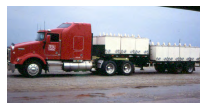
Medium sized tractor-trailer rig used to haul baitfish to shops or small bait distributors. Each tank is supplied with oxygen.

Deliveries depend on the truck size, tank capacity and the type of markets serviced. Live haulers catering to smaller markets will typically employ trucks with multiple smaller tanks and haul several thousand pounds of fish. Haulers serving wholesale markets or distributors will use larger tractor-trailers,