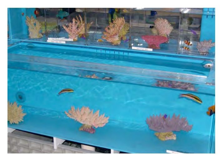
Aquarium and display tanks help showcase ornamental aquaculture products and pique customer interest.

Oysters and mussels traditionally have often been marketed with a branding name, a long-standing practice that often links the product to the location where it is grown. A specific market name is a touchpoint that consumers can recognize instantly. A brand name is particularly important in venues (such as an oyster bar) where customers can select from a variety of shellfish sourced from different areas. A good brand name can help give prominence to a specific grower's product.