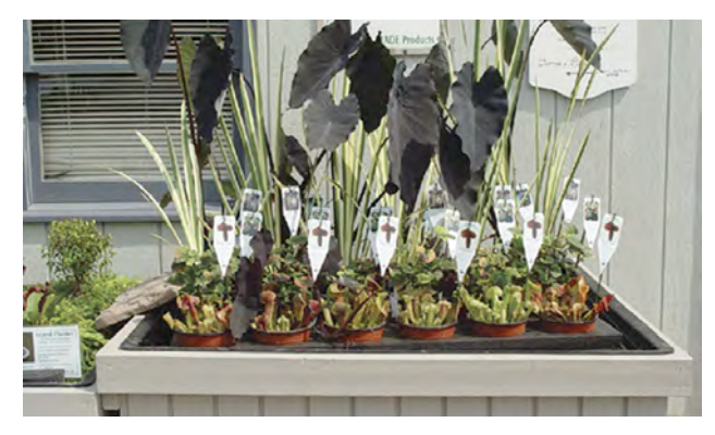
Attractive displays at garden centers or plant shows are effective in educating consumer and marketing aquatic plants.