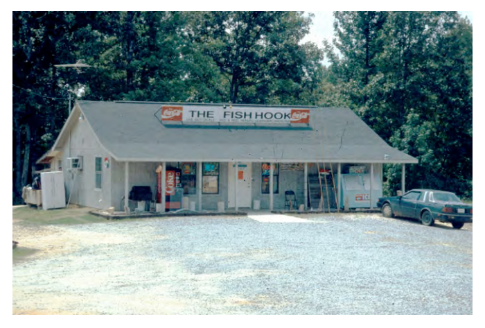
Baitshops are a main market outlet for farm-raised baitfish.