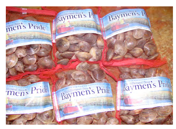
Branding can help build product recognition and consumer interest in local food supply.

customers get to know you, your farm, and your products.