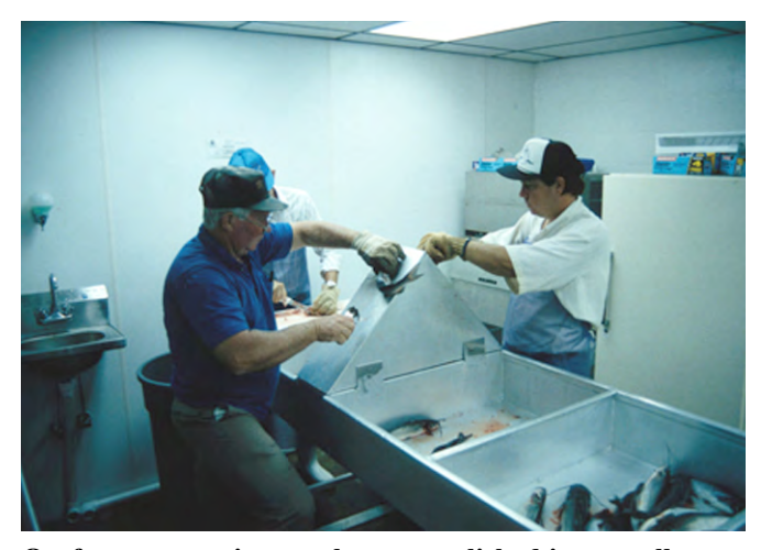
On-farm processing can be accomplished in a small room of an existing building to tap into local direst sales to consumers.

http://www.nrac.umd.edu/publications/factSheets.cfm).