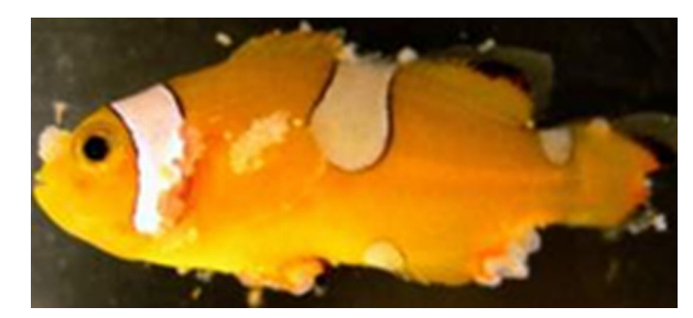
Figure 2. Clownfish with lymphocystis nodules on fins and body.

Pop-eye (exophthalmia; marked protrusion of the eye) has also been seen and results from lymphocystis masses in or behind the eye pushing the eyeball out.