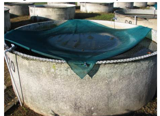
Figure 2. Shade cloth helps lower water temperature during the hot summer months.

Water Quality: Prior to stocking and weekly thereafter, dissolved oxygen (DO), pH, salinity, total ammonia nitrogen (TAN), total alkalinity, and total hardness were recorded for each pool. Salinity was maintained at 5-6 ppt