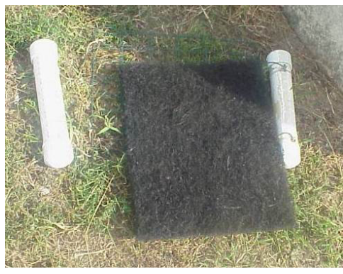
Figure 3. Spawntex* mat with PVC floats.

from the container was poured through nylon mesh (window screen) to collect the eggs. The eggs were separated from debris