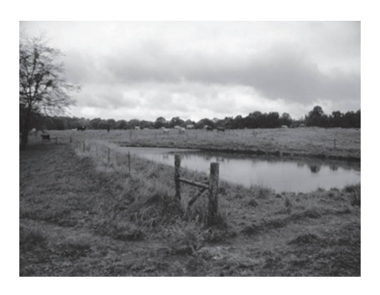
LAWRENCE COUNTY SOIL AND WATER CONSERVATION DISTRICT USDA NATURAL RESOURCES CONSERVATION SERVICE

Eligibility for participation in all programs administered by the SWCD, NRCS, and IDNR is established under law without regard to race, color, age, religion, sex, national origin, disability, marital/family status, political affiliation, or sexual orientation.