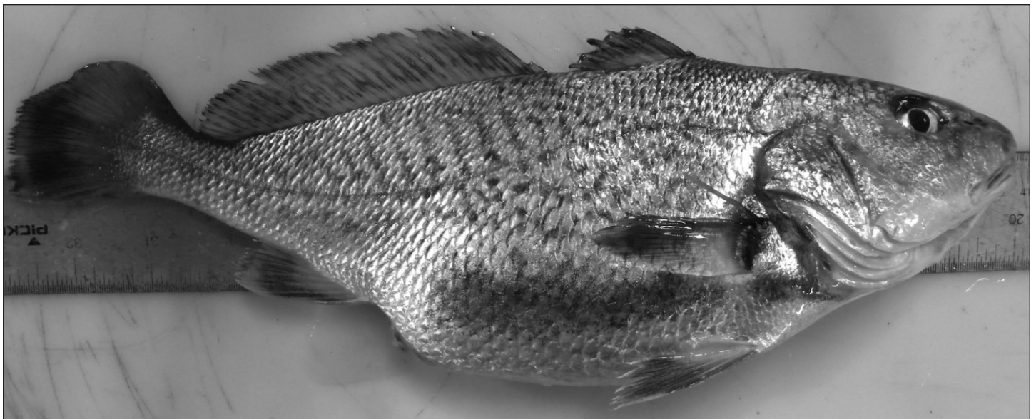
Figure 1. A gravid female Atlantic croaker with free-flowing eggs 72 hours after injection with a salmon Gonadotropin-Releasing Hormone analogue implant.

Wild-caught Atlantic croakers were first induced to spawn with hormones (chorionic gonadotropins) in the 1970s. Injections had to be repeated many times for each female over a period of days or even weeks, and only 25 percent of females produced viable eggs using chorionic gonadotropins. Therefore, induced spawning, and the reproduction of croakers in general, were neglected until recently when other hormone treatments became available. The use of hormone implants containing salmon Gonadotropin-Releasing Hormone analogue (sGnRH a ) has been successful (Fig. 1). A single 75-μg sGnRH a implant injected under the skin when water tempera-