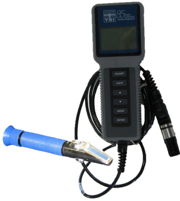
Figure 3. A refractometer is a relatively inexpensive instrument for checking salinity. Digital salinity meters are more costly but can be more precise. Different models can also measure other water quality characteristics.

not contain potassium, magnesium, and calcium, which are very important ions that cocahoes need to survive. Never use table salt. The iodine and additives it contains can be harmful to fish and invertebrates.