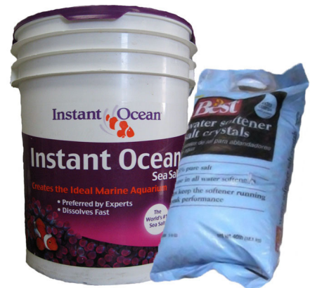
Figure 2. Several examples of commercially available salt.

The kind of salt to use depends on the source of the water. It is important to get the water tested for ionic content; Louisiana State University Department of Agricultural Chemistry charges about $15 to test a water sample. There are also private companies that will test water samples usually for a fee. When using dechlorinated water from a tap or hose it will most likely require a marine salt. When using natural water from a bayou, estuary or pond, many of the additional ions may be present. If the water has most of the required ions, a cheaper salt, like rock salt, may be adequate or it may need to be supplemented with only a single missing ion like potassium. Rock salt is typically much less expensive than marine salt especially when using large quantities. For this reason it is best to use rock salt due to cost. However, it does