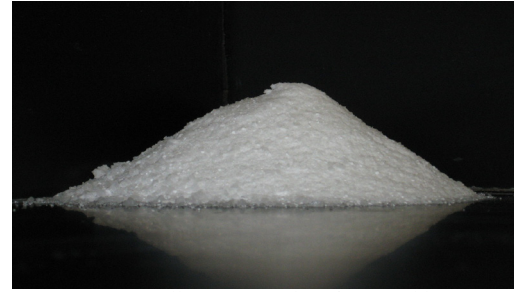
Figure 4. Typically marine salt is finer and less coarse than rock salt or halite.

hydrometer, to a slightly more expensive refractometer, to the several thousand dollar electric water quality meters that can measure salinity, dissolved oxygen, pH, temperature, depth, etc. In most cases, a hydrometer or refractometer will be more than sufficient. Do not mix the startup water while the fish are in it as the rapid change in salinity can cause shock. Make sure salinity is at the right level before adding water to livestock.