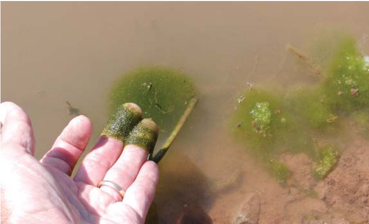
Figure 17. Strands of filamentous algae.