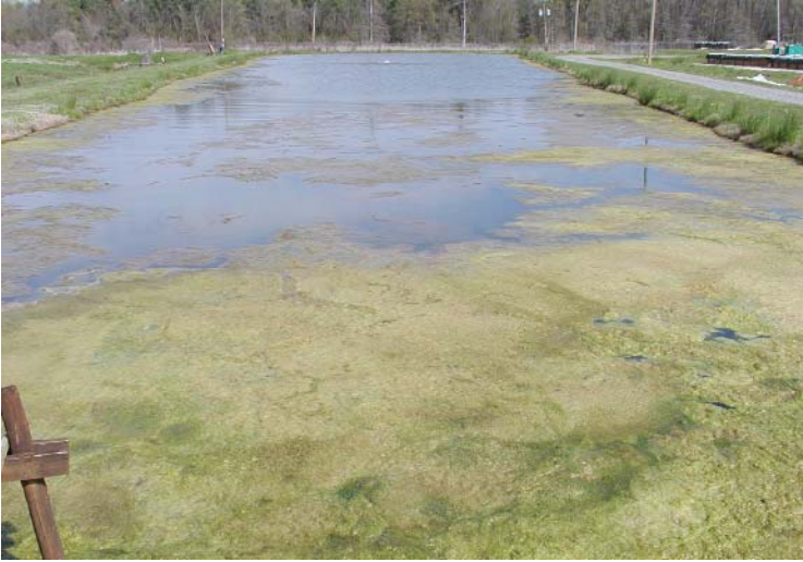
Figure 16. Filamentous algae can form dense mats on the pond bottom and at the surface.