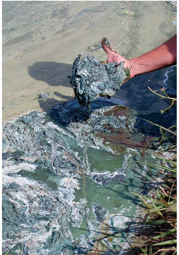
Figure 7. Blue-green algae may form dense scums on the pond surface.