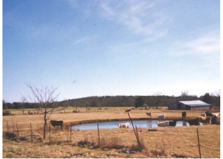
Figure 2. Nutrients from livestock wastes can result in algae problems.