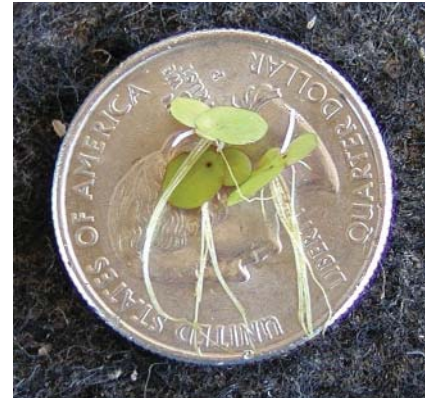
Figure 13. Duckweed has tiny hair-like roots.