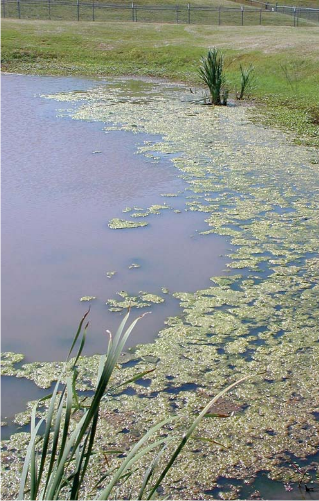
Figure 1. Ponds often develop mats of filamentous algae.