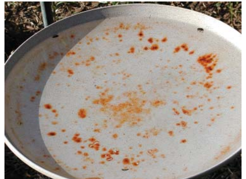
Figure 9. A red algae is commonly found growing in bird baths.