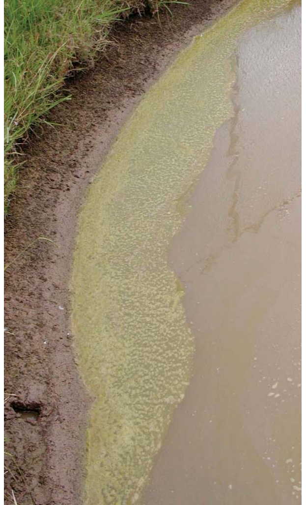
Figure 18. Scum filled with bubbles along a pond edge.