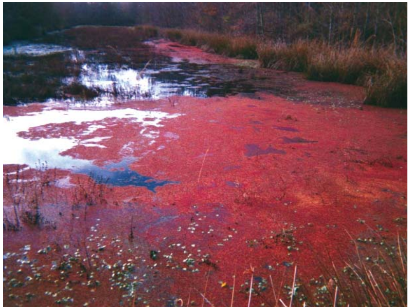
Figure 15. Azolla may also have a red color and is found in wetlands.