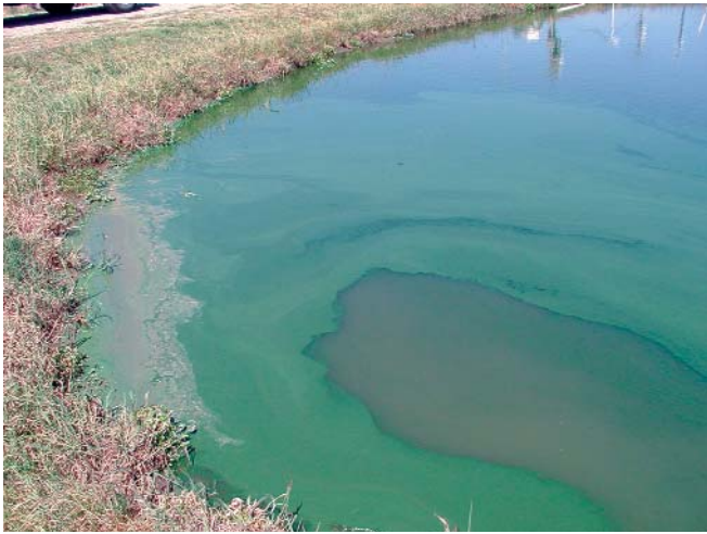
Figure 5. Dense algae blooms can give ponds a “pea soup” color.