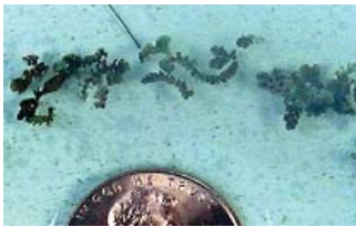
Figure 14. Azolla has tiny, fern-like leaves.