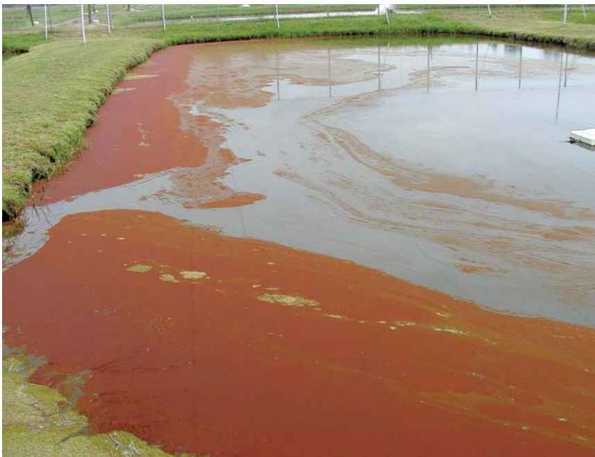
Figure 8. Red scums sometimes form on freshwater ponds.