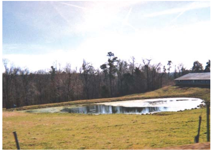
Figure 3. Organic fertilization is often linked to filamentous algae problems.