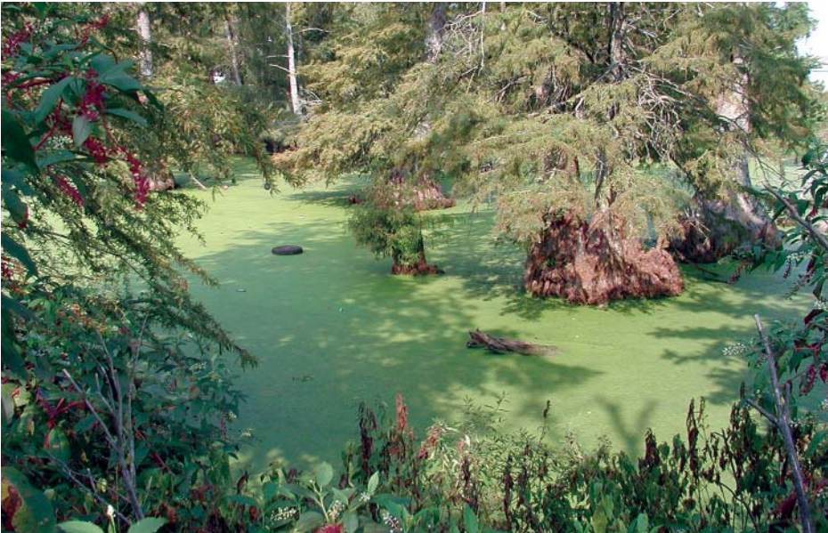
Figure 12. Duckweed forms a green cover over the surface of ponds.