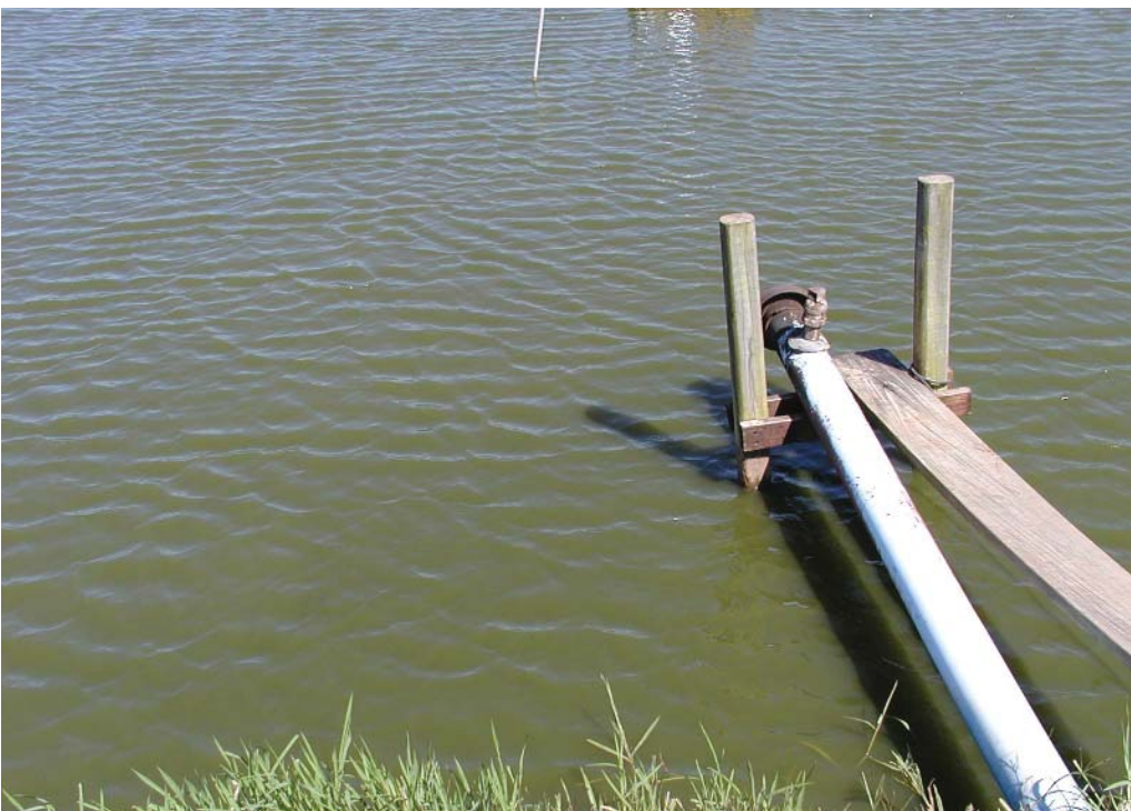
Figure 4. Microscopic algae, or phytoplankton, color water in various shades of green.