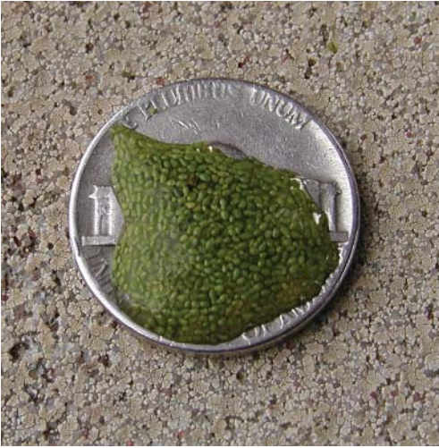
Figure 10. Water meal is tiny but can form a film on top of ponds.