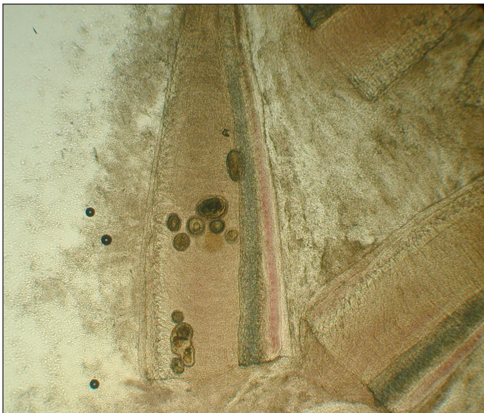
Figure 1. Multiple granulomas visible on a wet-mount of a gill biopsy from a largemouth bass (100x).

Vaccines are not currently available, though they may be developed in the future. There is no effective treatment for infected fish, so prevention through the use of quarantine and disinfection protocols is critically important. Populations of fish that harbor the infection are most often euthanized and the system they were housed in disinfected with appropriate agents. Currently, there are no non-lethal tests for screening fish for mycobacterial diseases.