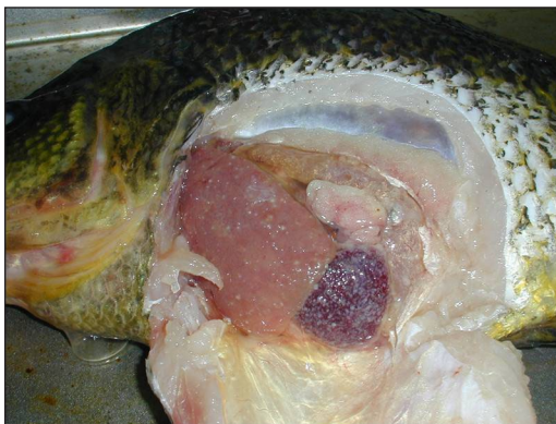
Figure 2. Small gray nodules visible within the spleen of a black crappie during necropsy. These small granulomas are consistent with a diagnosis of Mycobacterium spp. and a special bench-top stain for acid-fast organisms should be done on a small sample of tissue.