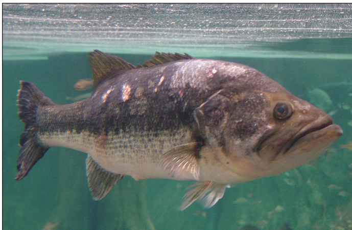
Figure 3. Largemouth bass showing clinical signs consistent with mycobacteriosis. The fish is thin and has obvious scale loss and shallow ulcers visible on the skin.

Reproductive problems are often part of the history of a mycobacterial case. Increased mortality and reproductive problems have been reported in affected zebrafish colonies. Because of the low level and chronic nature of mortality, poor reproductive performance may be the primary complaint that leads to diagnostic investigation of these fish. Although granulomas are a classic lesion associated with mycobacteriosis, they do not always develop. Further, Mycobacteria spp. have been isolated from tissue of clinically normal fish in the absence of obvious disease or pathology.