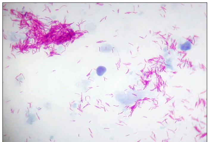
Figure 5. Pink-staining acid-fast rods visible in a bench-top stain of fresh tissue from a fish infected with mycobacteriosis (1000x).

Observing acid-fast staining rods during histological examination would be strong support for a diagnosis of mycobacteriosis (Fig. 4). Organisms are most likely to be present either intracellularly or extracellularly within granulomas, although if there are few live bacteria in tissue the acid-fast rods may not be seen. The ability to see acid-fast rods in tissue can also be affected by processing. The decalcification process, in particular, may prevent organisms from taking up the acid-fast stain. Immunocytochemistry can be used to support a diagnosis of mycobacterium and may be more sensitive than the visualization of organisms using special stains. However, it will not identify the organism to species.