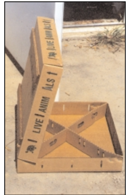
Box for shipping pet turtles.

Current export markets for baby pet turtles show little sign of dramatic expansion over the next