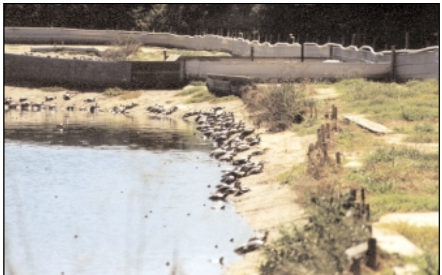
Turtles leave pond to nest.

Eggs are initially washed for 5 to 10 minutes at 95 to 100 °F (35 to 38 °C) with a dilute chlorine solution made by adding 3 to 4 teaspoons of fresh commercial chlorine bleach to 1 gallon of clean water (4 to 5 ml of bleach per liter of water). Eggs are usually washed in machines developed for the poultry industry. Then they are thoroughly rinsed and dried. The next step is to infuse the developing eggs with antibiotics to prevent any salmonella infections from progressing. An antibiotic such as Garasol ® (gentamicin) is used as a dip solution (1000 ppm gentamicin) in a vacuum chamber. Suitable chambers are available from a variety of commercial suppliers. Egg baskets are immersed in the solution and the chamber sealed. A 25- to 27-inch (63- to 69-cm) vacuum is held for 5 minutes, then released slowly.