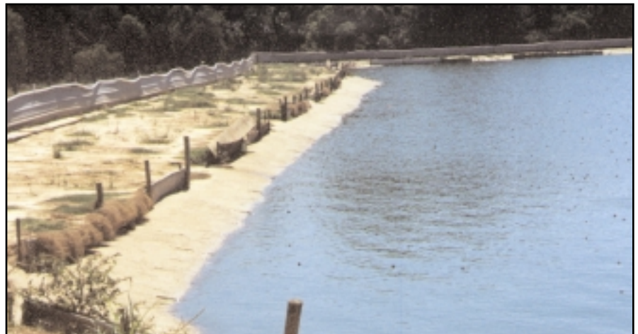
Turtle production pond, with sandy nesting area and perimeter fence.

Brood turtles are typically fed floating catfish feed, although some producers use specially formulated rations. Commercial turtle diets typically contain 22 percent protein, with alfalfa meal or other plant products as a protein source. Vitamins A, D and E are important nutrients; if formulated feeds do not contain enough of these vitamins turtles must be offered green, leafy vegetables.