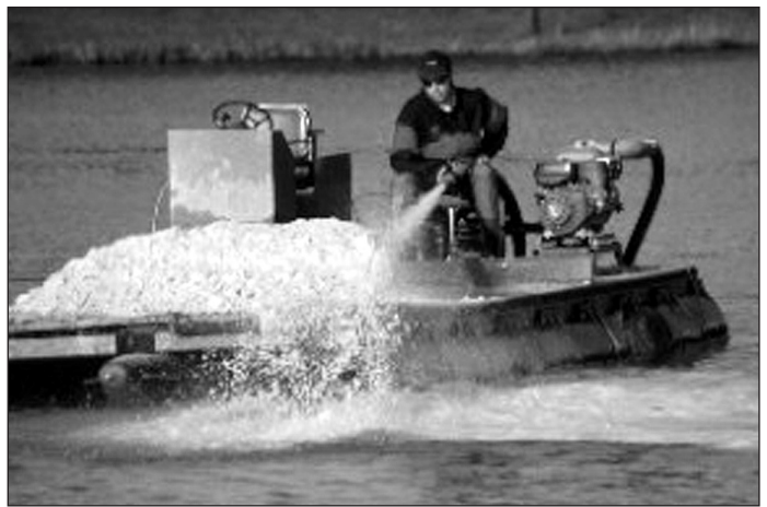
Figure 3. Agricultural lime being distributed evenly over a pond from a pontoon barge.

If the pond contains water, lime should be applied evenly over the entire pond surface. Lime is loaded onto a boat or barge and then shoveled or washed uniformly into the pond (Fig. 3). Often a sheet of plywood can be attached across the front of one or two small boats and the lime placed on the plywood. Lime is heavy and shoveling it is tedious. Therefore, some pond owners hire professional companies with liming barges to spread the lime. For small ponds of less than 1 acre, liming trucks can be backed up to the edge of the pond and the lime distributed with the spreader on the truck. This method works best if the truck can move around the entire pond and broadcast the lime evenly.