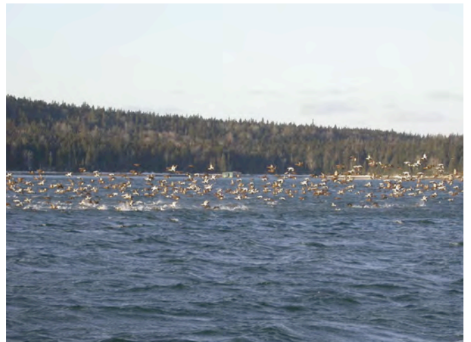
Figure 12. A group of Common Eider ducks – Somateria mollissima . An adult bird can eat over 30% of its body weight in mussels per day, and eiders often collect in groups, called ‘rafts’ of several hundred individuals.

Predation from diving ducks such as the Common Eider ( Somateria mollissima ) can be devastating to the mussel producer, certainly with the potential to wipe out an entire crop (Figure 12). Raft producers can use predator nets to surround the raft, whereas longline and bottom culturists cannot. The best control against duck predation is a personal presence by the farmer, to chase ducks away. Since a personal presence is often not possible on a daily basis, such as when weather does not allow it, producers may rely on a set of deterrents. Deterrents are best used in rotation and combination. Common approaches include the use of owl decoys, chasing the ducks off the site – sometimes using ‘crackers’ fired from a hand gun-like device, lasers (both over and under the water) or mooring an unmanned skiff on the farm. But the birds become accustomed to many of