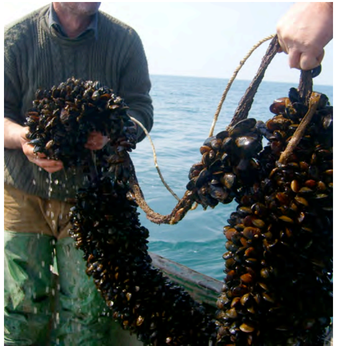
Figure 9. A mussel sock after deployment showing mussels that have emerged from the sock.

10) can be used. In this way the weight of the mussels is borne by either the socking pins or the socking collars at short intervals instead of the weight bearing down along the entire length of the socking tube.