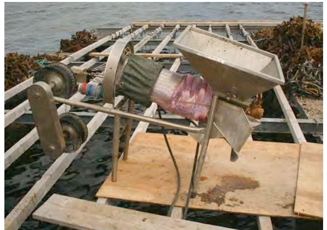
Figure 7. Mussel socking machine, manufactured by Aguin, used in mussel raft culture. Drop lines are fed under the hopper, and mussels are wrapped up against the line by cotton sheeting. The cotton sheet degrades, after the mussels have attached their byssal threads to the dropline.

Discontinuous longlines, with drop lines of 4.5m (15ft) or so, most often use polyethylene socking, whereas the continuous longlines and mussel rafts most