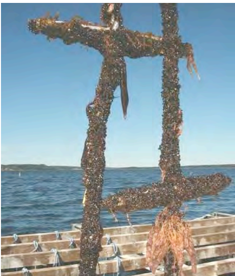
Figure 6. Mussel seed on raft drop line, with cross pegs still visible.

One frequent question among those new to farming mussels is why the mussels cannot be simply left on spat collectors until they grow to market size. The answer is that mussel densities can be so high that they will be stunted because of competition for food resources, and if the set of spat is thick enough, the weight of the crowding mussels causes section or the entire mass of collected mussels to fall off and drop to the bottom. However, some of the seed ‘dropoff’ problem can be controlled by cross-pegging of spatlines (Figure 6).