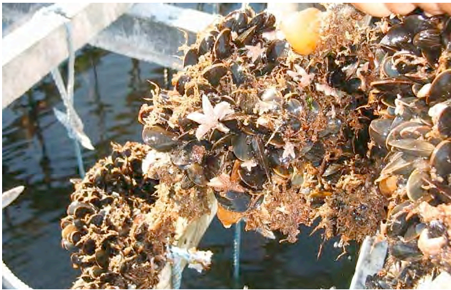
Figure 11. Sea Stars and other fouling organisms on a drop line from raft culture.

Pests could include organisms such as barnacles, and solitary or colonial ascidians, also known as sea squirts. Sea squirts such as Ciona intestinalis , Styela clava , Botryllus scholsseri , Molgula manhattensis and Botrylloides violaceus can smother the crop, and make the gear too heavy to service. (Figure 11).