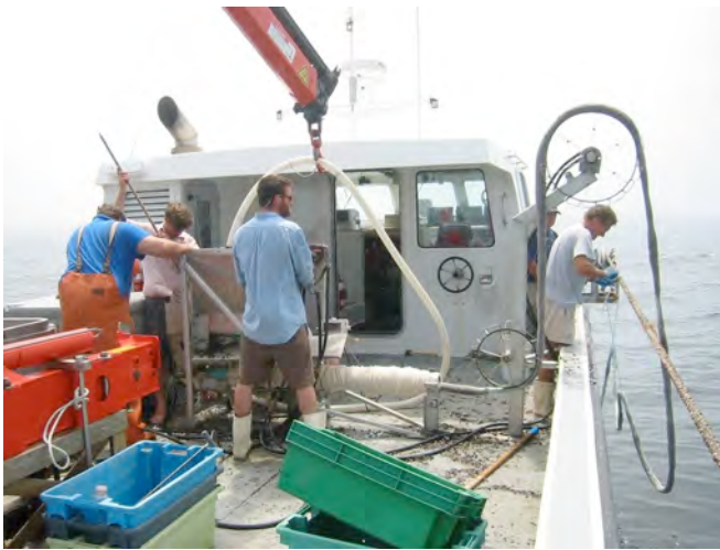
Figure 8. A shipboard continuous socking machine for seed socking of continuous longline droppers.

often use cotton socking or wrapping as socking material. Shorter drop lines can be created with the use of a socking table; essentially a hopper for seed mussels. At the bottom of the socking table is a pipe (the ‘horn’) of a diameter that snugly fits inside socking. Prior to placing mussels in the sock, a rope is inserted down the center of the sock to provide strength to bear the weight of the mussels as they grow. Mussels are then filled into the sock by running water into the socking table, which carries seed mussels into pipe and the sock, much as meat is forced into sausage casings in the sausage making process. For larger-scale mussel farming operations there are commercially available machinery to fill socks that can be in the hundreds of meters in length (Figure 8).