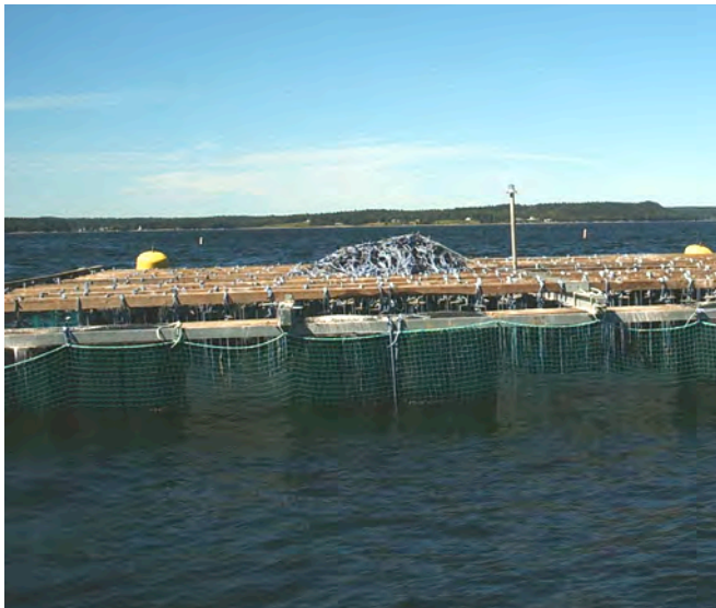
Figure 1. Mussel raft: 40 square foot, with some dropper lines visible under the platform.

Modern mussel rafts are constructed with steel I-beam main frames, wooden crossmembers, and large polyethylene floats. Most measure 40 feet square and are capable of supporting up to 400 droplines of roughly 45 feet-long each (Figure 1). Roughly 40,000 lbs. of mussels can be reasonably expected in an 18-month cycle from seeding to harvest. Raft systems are most appropriate for reasonably protected areas, in fairly shallow water. They have the advantage of providing a stable work platform, and the disadvantage of being susceptible to damage from heavy weather (Clime and Hamill, 1979).