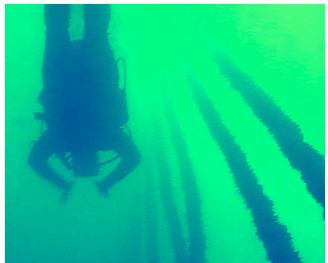
Figure 3. A diver inspecting dropper lines with mussels on a submerged longline system in New Hampshire.

Bottom culture is an approach that uses reduced densities of mussels on the sea floor to achieve high growth rates and a good meat-to-shell ratio. A producer may locate an appropriate site and seed small mussels on to it, or may find an established bed, and use a strategy of thinning and dispersal to grow the product. Careful site selection is especially important, as the influences of temperature, primary productivity, siltation, predators and other competing organisms can have great effects on the crop. Bottom culturists avoid the capital and maintenance costs of growout gear, but must spend extra attention to quality, and generally experience lower meat weights than suspension culture methods.