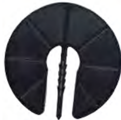
Figure 10. A typical mussel socking collar or anti-sloughing disk that is made of polypropylene plastic and is 20cm (8 inches) in diameter.