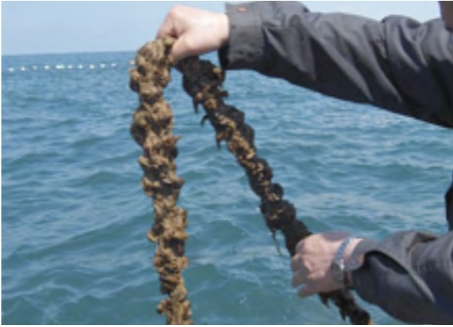
Figure 5. Freshly set mussels on a spat collector suspended from a floating longline.

One frequent question among those new to farming mussels is why the mussels cannot be simply left on spat collectors until they grow to market size. The answer is that mussel densities can be so high that they will be stunted because of competition for food resources, and if the set of spat is thick enough, the weight of the crowding mussels causes section or the entire mass of collected mussels to fall off and drop to the bottom. However, some of the seed ‘dropoff’ problem can be controlled by cross-pegging of spatlines (Figure 6).