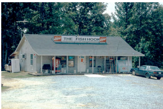
Baitshops are a main market outlet for farm-raised baitfish.