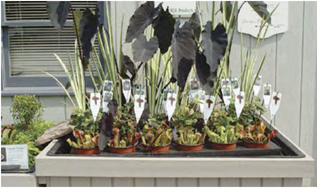
Attractive displays at garden centers or plant shows are effective in educating consumer and marketing aquatic plants.