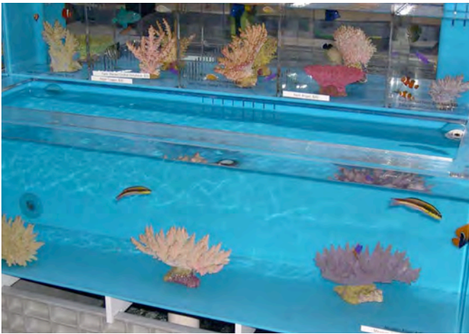
Aquarium and display tanks help showcase ornamental aquaculture products and pique customer interest.

Oysters and mussels traditionally have often been marketed with a branding name, a long-standing practice that often links the product to the location where it is grown. A specific market name is a touchpoint that consumers can recognize instantly. A brand name is particularly important in venues (such as an oyster bar) where customers can select from a variety of shellfish sourced from different areas. A good brand name can help give prominence to a specific grower's product.