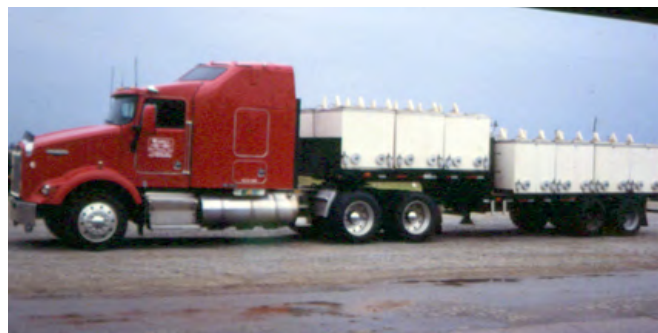
Medium sized tractor-trailer rig used to haul baitfish to shops or small bait distributors. Each tank is supplied with oxygen.

Deliveries depend on the truck size, tank capacity and the type of markets serviced. Live haulers catering to smaller markets will typically employ trucks with multiple smaller tanks and haul several thousand pounds of fish. Haulers serving wholesale markets or distributors will use larger tractor-trailers,