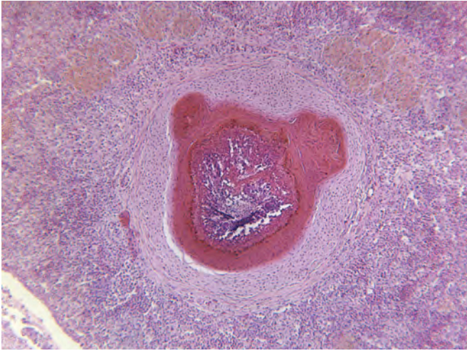
Figure 1. A mycobacterial granuloma in a cultured hybrid striped bass (Hematoxylin and Eosin Stain). This histopathology is a common observation in fish infected with mycobacteria.